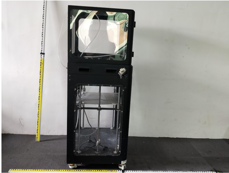
Photo 2 Appearance of EUT