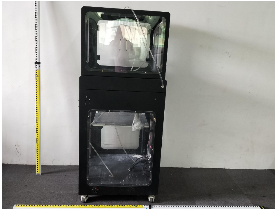
Photo 4 Appearance of EUT